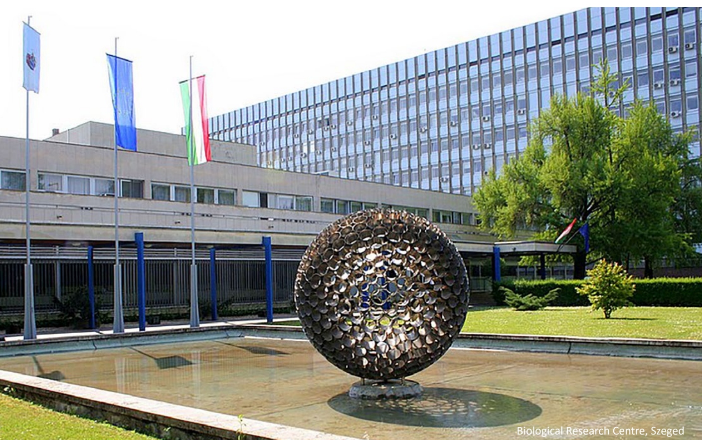
Biological Research Centre, Szeged